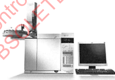
Figure 2. Gas Chromatograph