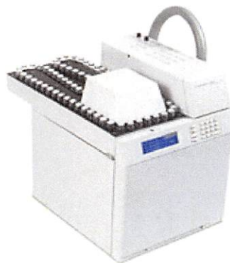
Figure 3. G1888 Headspace Analyzer